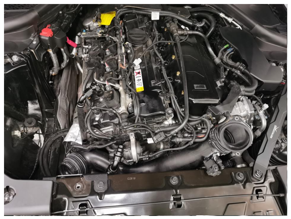
Step 6, Picture 2